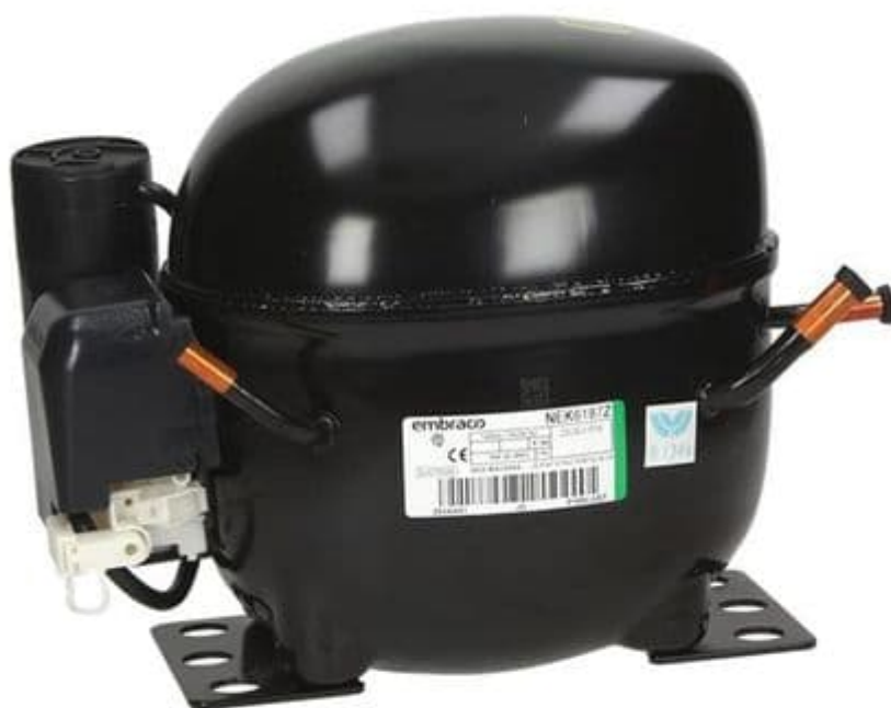
Aspera / Embraco NEK6187Z Refrigeration Compressor R134a HMBP 10CC 3/8Hp Tubed 240V~50Hz