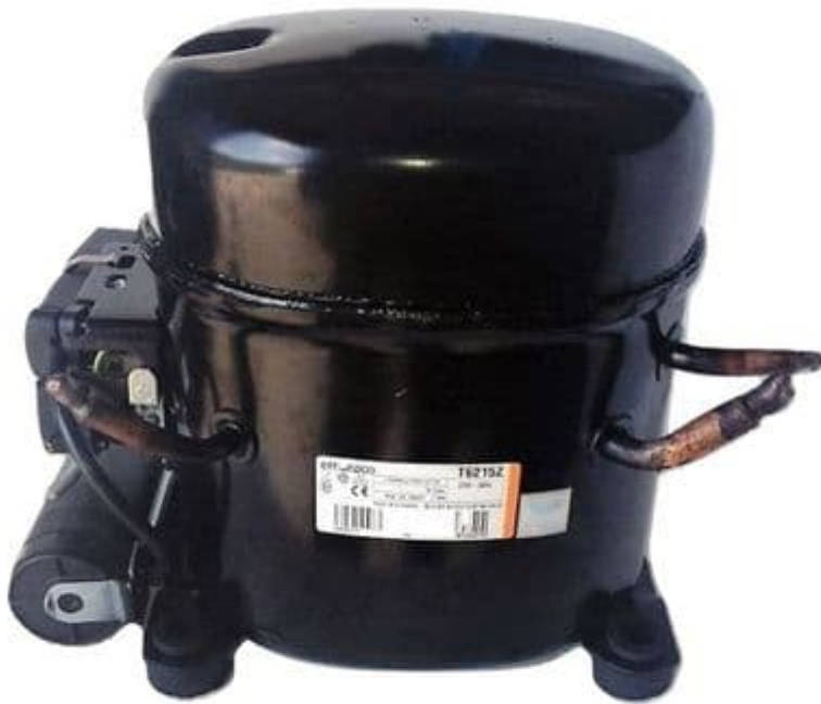
Aspera / Embraco NT6215Z Refrigeration Compressor R134a HMBP 17.4CC 5/8Hp Tubed 240V~50Hz